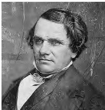
Stephen A. Douglas