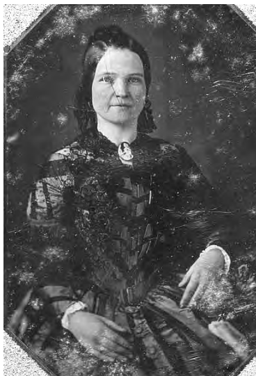
Mary Todd Lincoln