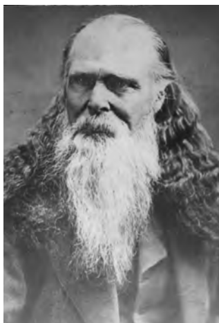
Orrin Porter Rockwell

Rockwell was released from his imprisonment and made his way to Nauvoo, where he appeared unannounced at Joseph and Emma Smith's Mansion House in the midst of a party on Christmas Day 1843. As recounted in Joseph's journal, "a man apparently drunk, with his hair long and falling over his shoulders come in and acted like a Missourian. I commanded the Capt[ain] of the police to put him out of doors. In the scuffle, I looked him full in the face and to my great surprize and Joy untold I discovered it was Orrin Porter Rockwell, just arrivd from a years imprisonment in Mo [Missouri]." 140 According to some accounts, Smith promised that Rockwell's enemies