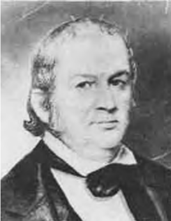
Judge Nathaniel Pope

The following day Joseph arose in good spirits, predicting that he should not go to Missouri, dead or alive. Judge Pope convened court at 10:00 AM, entering the courtroom with seven ladies, who took their seats beside the judge. 87 Nathaniel Pope was then fifty-eight years old and one