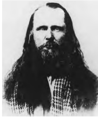
Orrin Porter Rockwell